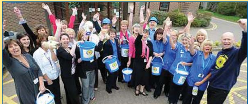
Celebrating the news of our £550,000 grant.

“Space is the biggest single issue, limiting the number of patients who can be seen and the activities that