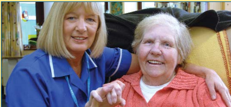
The new Day Care Centre: transforming the service we offer.

See inside for more on our exciting building development plans.