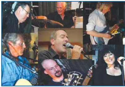
The Big Event: summer fun for everyone

Tickets are now on sale for the East Cheshire Hospice Big Event, taking place from the 10th-13th June, on Victoria Road. Set to be one of Macclesfield's biggest summer events, these four days will attract people of all ages.