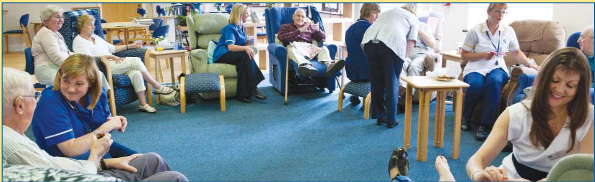
Our Day Care Centre: delivering great care but in a building that is working against us.

Everyone at East Cheshire Hospice is celebrating the amazing news that we are to receive a £550,000 Department of Health grant which, along with the recent receipt of a number of generous legacies, is enabling work to begin on a much needed building project to transform our Day Care Centre and build a new Out-patients annex.