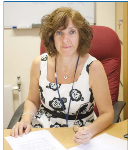
East Cheshire Hospice: Fit for today and the future.

I would like to take this opportunity to thank all the staff, volunteers and supporters of East Cheshire Hospice for